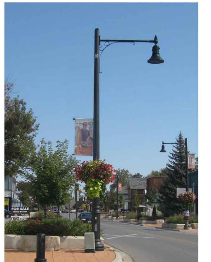
Decorative light standard with hanging baskets and banners (Port Colborne)